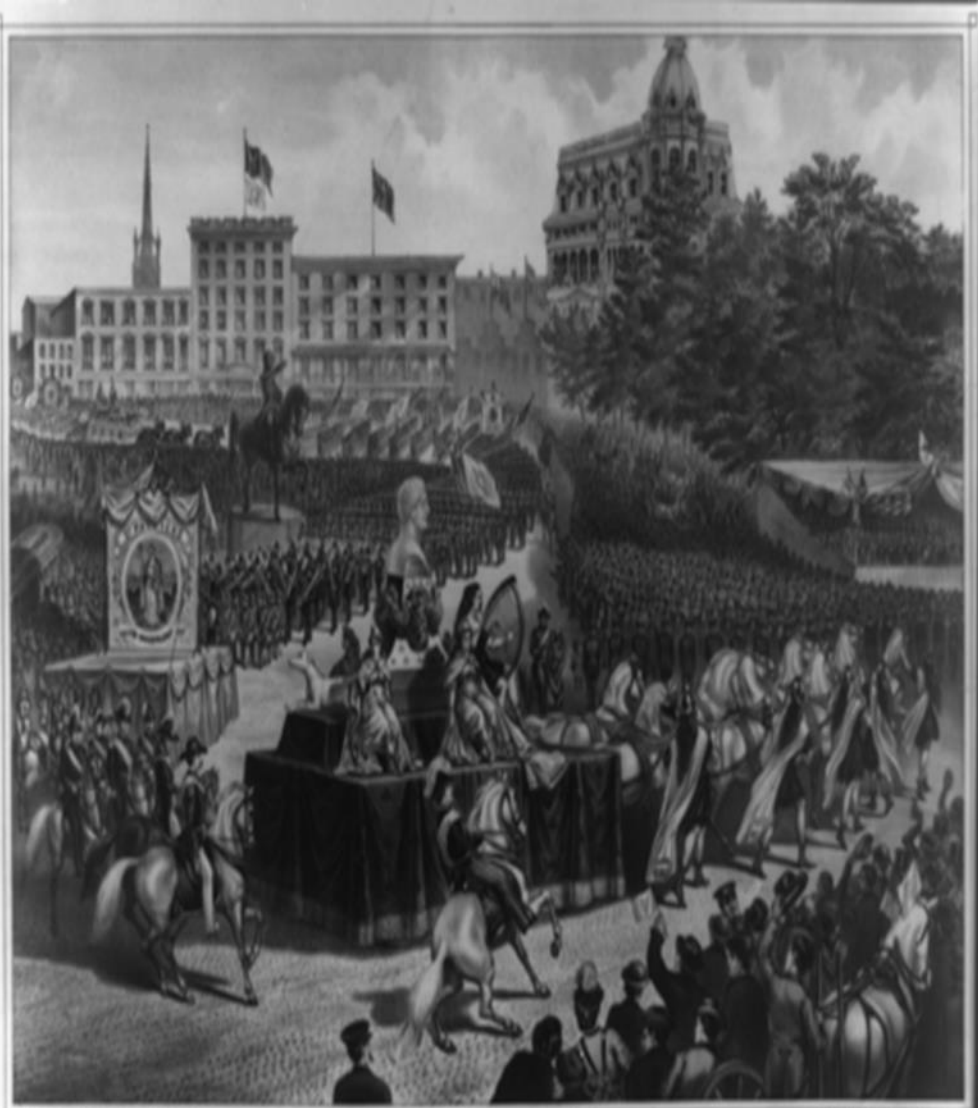
ST. PATRICK'S DAY IN AMERICA

The first St. Patrick's Day parade took place not in Ireland but in the United States.